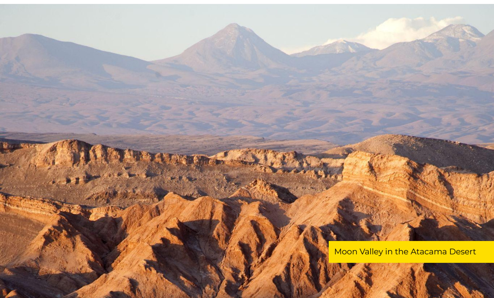
Moon Valley in the Atacama Desert