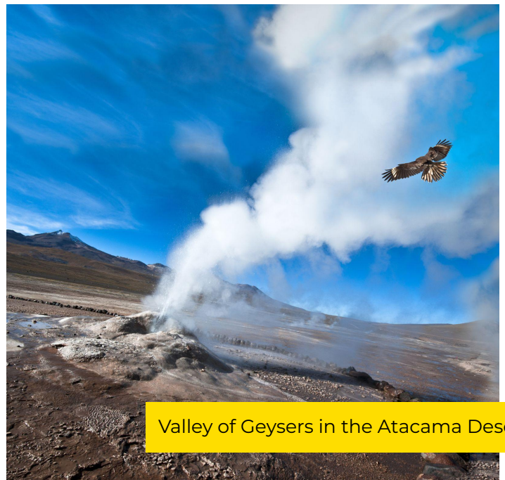
Valley of Geysers in the Atacama Desert