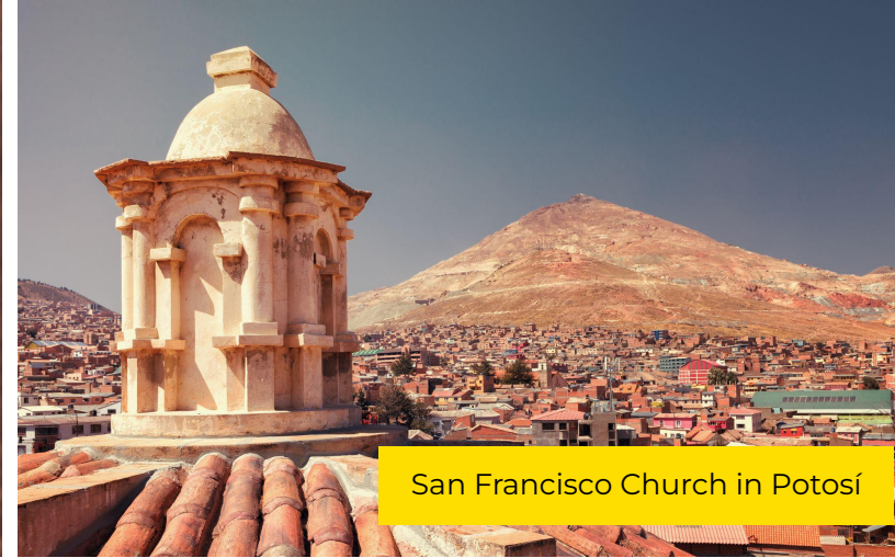
San Francisco Church in Potosí