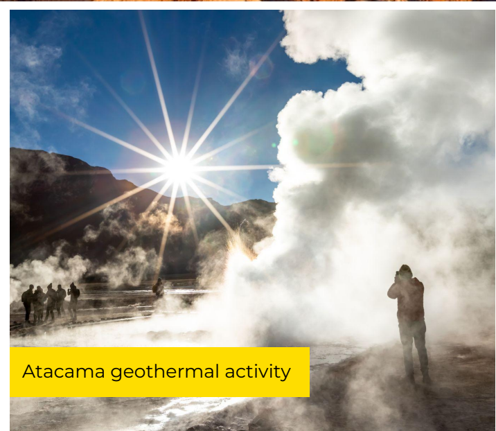
Atacama geothermal activity